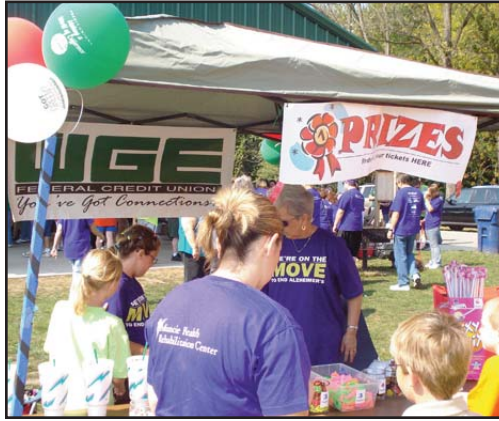
Children redeem tickets they won playing free games at the 2008 Memory Walk Kids' Tent sponsored by WGE Federal Credit Union.

sor the Kids' Tent at the Memory Walk. Kids of all ages may come by the kids' area to play free games and win prizes during the walk.