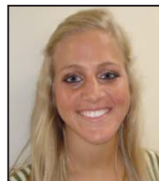
Jessie Henry Teller Bethel Branch